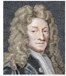
Who was Christopher Wren?