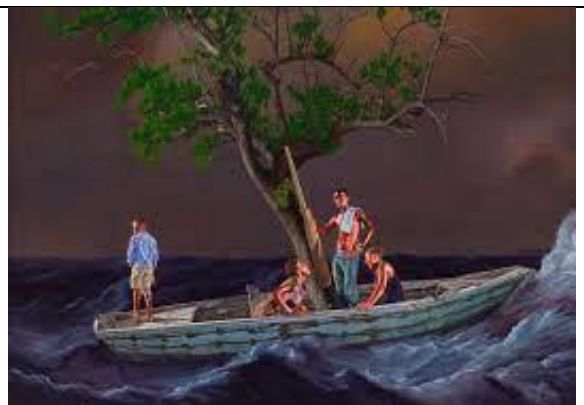
Ship of Fools