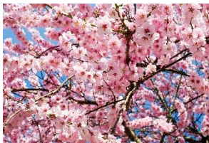
Blossom on trees

Look out for signs of Spring in your garden or in your local park. Can you see any of these things: