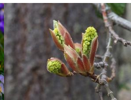
Buds on trees and plants

Practise your cursive handwriting. Choose some letters from below to practise at home: