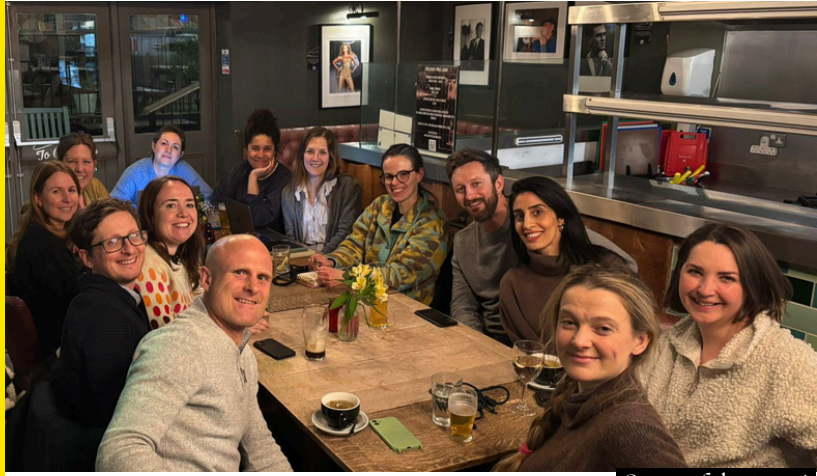
Some of the team!

Welcome to the first ever edition of your new Friends of Kilmorie newsletter, Friend Zone.