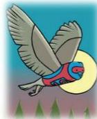
ow wow owl