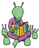
ear get near to hear

For each new sound there is a catchphrase!